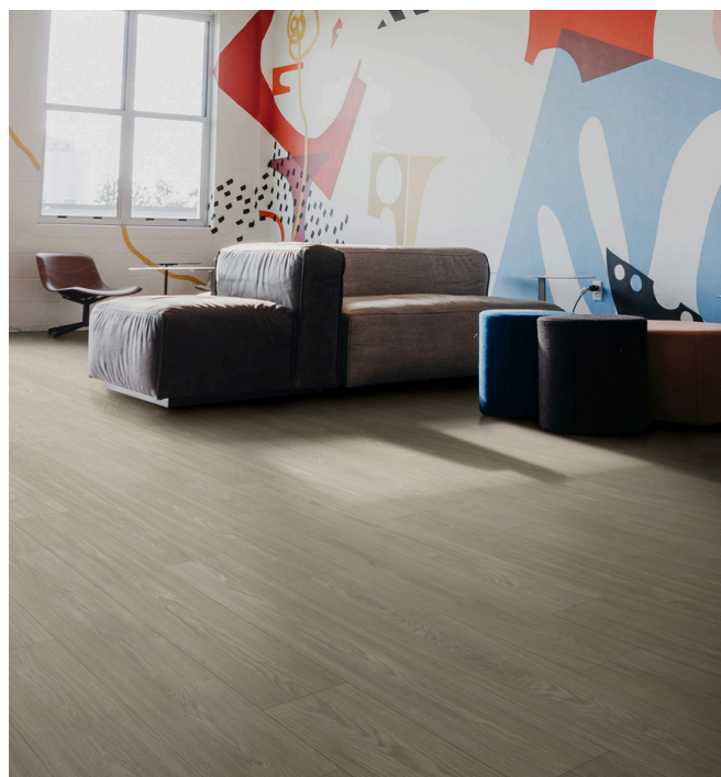
AQ 2359 Tahoa Oak Medium Greyish Brown