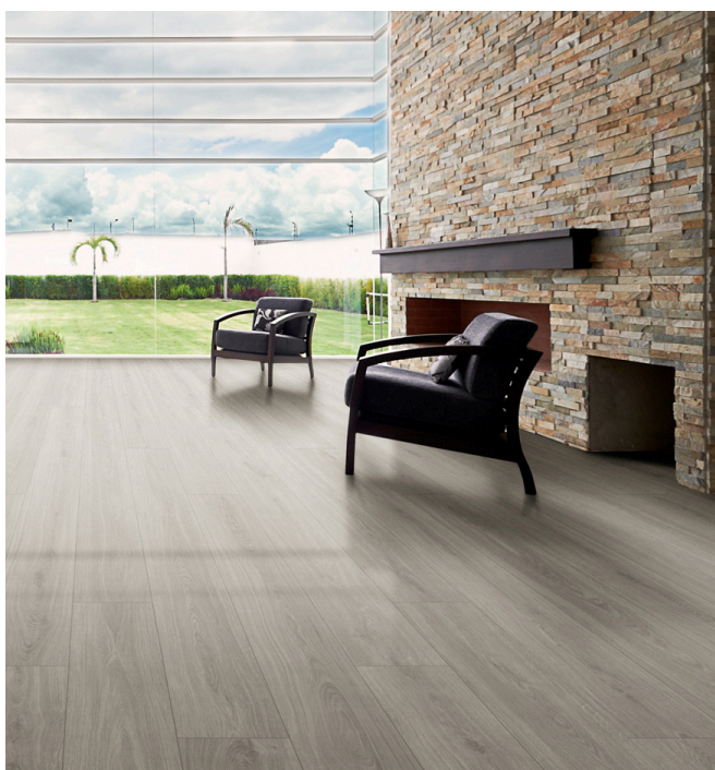
AQ 2767 Chandelier Oak Pearl Grey