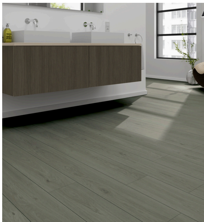
AQ 6427 Preston Oak Iron Grey