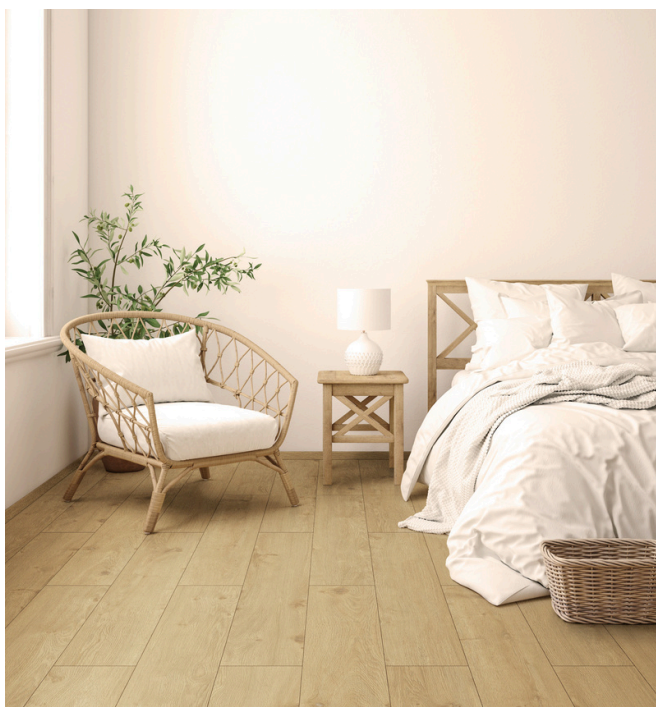
AQ 0307 Roble XL Light brown