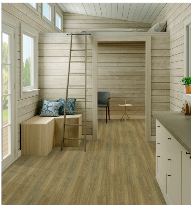
AQ 6428 Hamilton Oak Caramel Brown