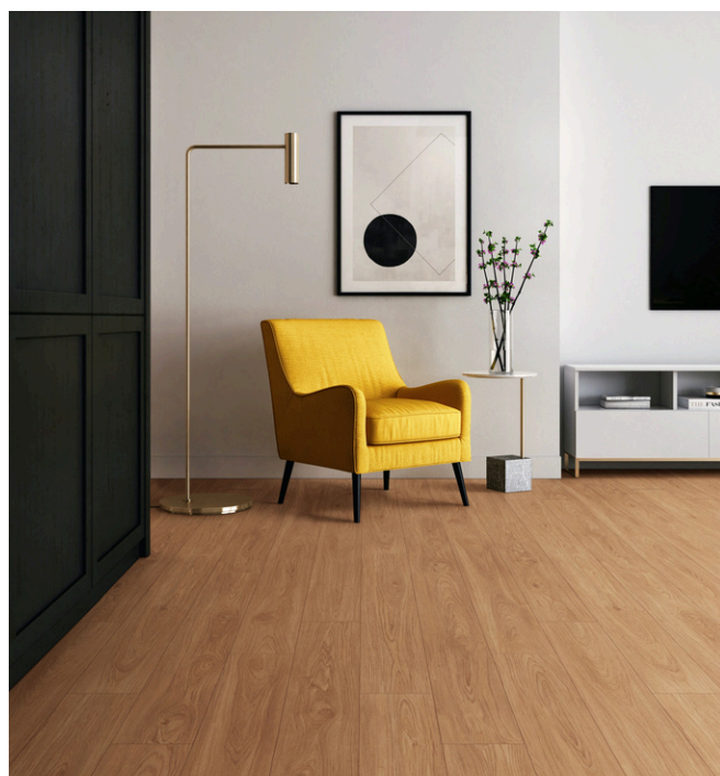
AQ 1682 Synchro Oak Honey Brown