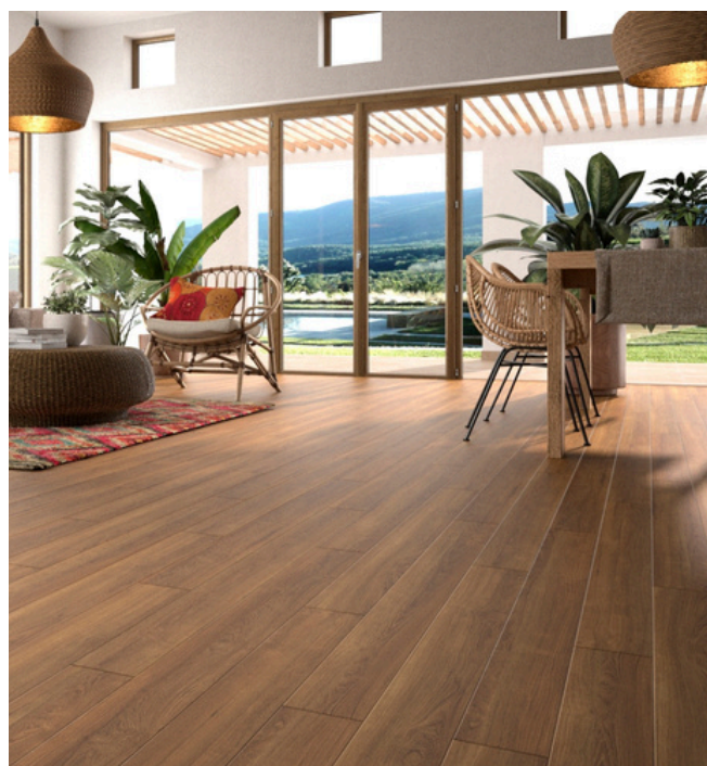
AQ O 136 Prestige Oak Tawny Brown