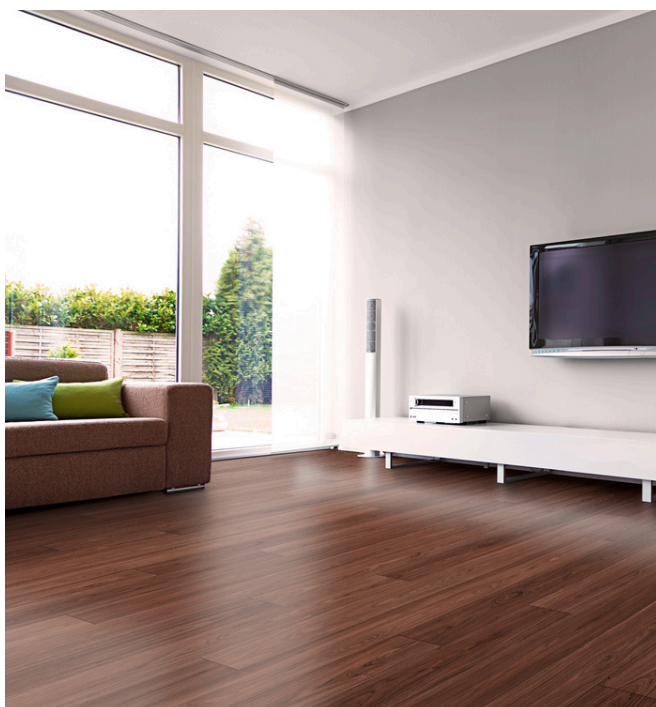
AQ 1403 Prestissimo Oak Walnut Brown